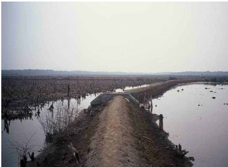
40 hectares of mangroves clear-felled for a shrimp farm on the Nicaraguan edge of the Gulf of Fonseca.

The expansion of shrimp aquaculture in Honduras began in 1972. By 2010, it remained without any plan for its development and expansion. The only mechanisms controlling its growth are shrimp diseases, the fall of international shrimp prices, falling demand and sometimes pressure from local communities. The destruction, pollution and displacement of communities plus the plundering of natural resources have given rise to a social movement aimed at reducing its impacts. The NGO CODDEFFAGOLF has led the movement since 1988 and set its objective to achieve the declaration of Wetland Protected Areas in the Gulf of Fonseca.