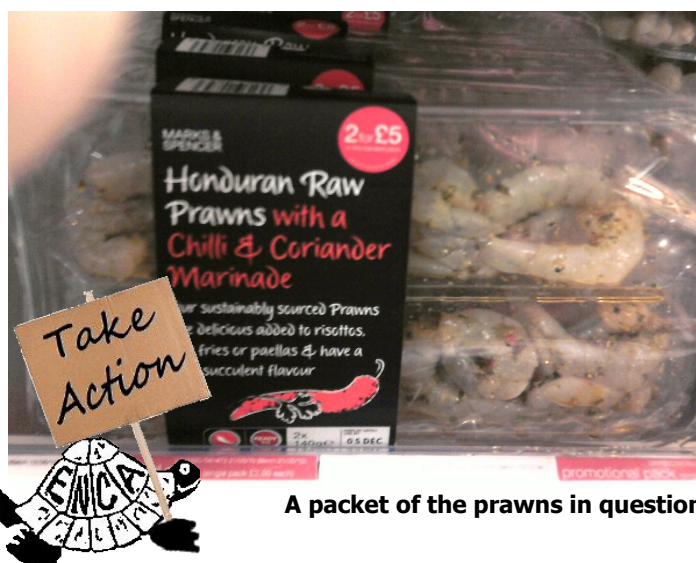
A packet of the prawns in question

Extracted and adapted from Jorge Varela Marquez (March 2010) 'Consumerism in developed countries causes destruction of wetlands in the tropics', CODDEFFAGOLF, Honduras