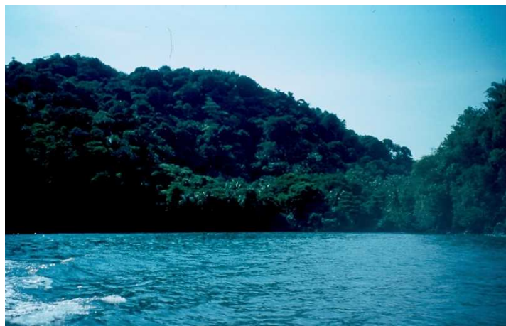
Bahia Escondido in the Jeannette Kawas National Park