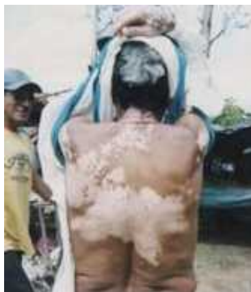
Some of the effects of Nemagon

In November 2007, Nicaraguan banana workers won a case for compensation against Dole Foods as a result of suffering a range of illnesses due to using the pesticide Nemagon in their work on Nicaraguan banana plantations – see ENCA Newsletters 39, 43, 44 and 48. They won considerable damages as a result of the ruling. In July this year, however,