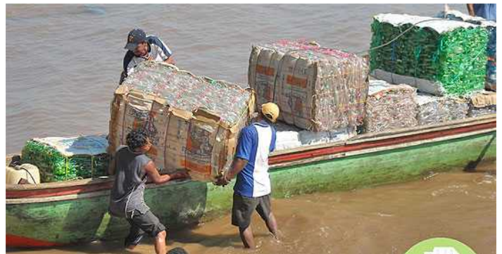
Loading bales of recycled material

"Previously the people dumped rubbish in the lagoon and Puerto Lempira looked ugly, full of rubbish and pollution that we created. It is from the lakes we take our principal food – fish," explained López in a visit to Tegucigalpa, in the local headquarters of the UNDP. "With the pollution, we were attacked by malaria and diarrhoea, but now it has decreased," she said.